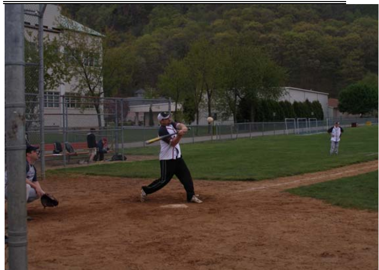
Thomaswick at Bat!