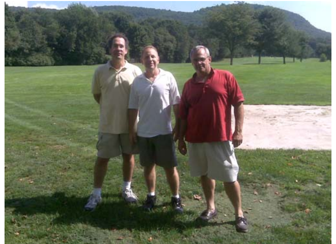
The Winning Team at the Men's Club Golf Tourney!

Please support Kol Ami as we strive to support you.